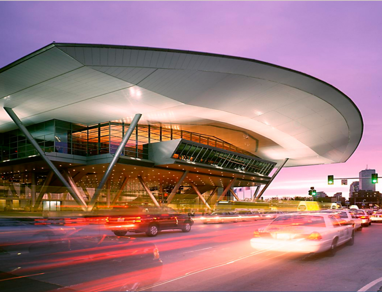
Boston Convention & Exhibition Center