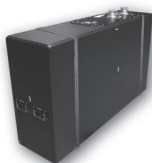
GUARDIAN® SINGLE IAFTS UH-60

(480) 337-7087 | robertsonfuelsystems.com